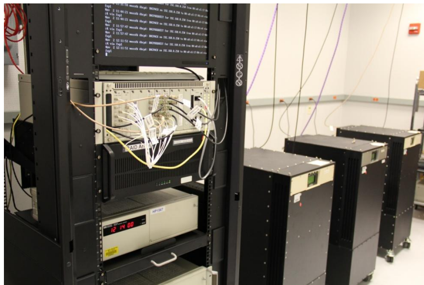
Figure 2. JHU/APL clock vault; 5 MHz phase comparator and cesium standards are in the left rack, Masers 1, 2, and 3 are freestanding to the center and right.

TFL Masers #1 & 3 and Cesiums #1, 3 & 4 were moved while powered to the new TFL facility on January 25, 2012, with no complications. Cesium #2 was left in the old TFL as a back-up in case there was a problem with the installation of the clocks into the new TFL. The 5MHz phase comparator system was moved the following day. Less than one day of clock data was lost during the move. Analysis of the clock data after one week of operation in the new clock vault showed no significant frequency changes in the clocks. Cesium #2 was moved one month later. Figure 2 shows the interior of the TFL clock vault after the completion of the movement of all clocks and 5MHz phase comparator system.