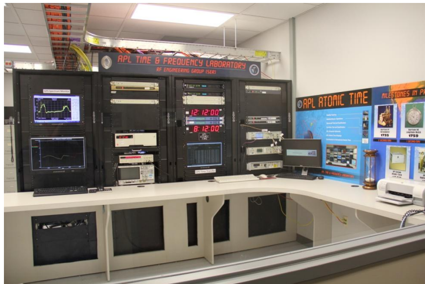
Figure 1. Interior of new JHU/APL TFL facility.

Cable conduits and raceways were also designed into the building features for intra-laboratory signal distribution within the Space Department building and cable access to the dedicated antenna platform on the roof. Extremely low-loss cables were pulled from the TFL to the other labs in the building and to the antenna platform. Also, a fiber-optic signal distribution system to all JHU/APL laboratories beyond the Space Department building was installed. The entire TFL is serviced by un-interruptible electrical power, backed up with stand-alone generators. Figure 1 shows the new JHU/APL TFL facility. Visible in the Fig. 1 image is GPS signal monitoring and performance monitoring of UTC(APL) in the left most equipment rack, clock display and distribution in the two center-most racks, and the precision frequency offset generator/master clock signal system in the right most rack.