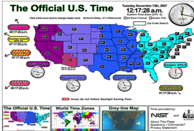
Figure 1. The initial view for the new time.gov site.