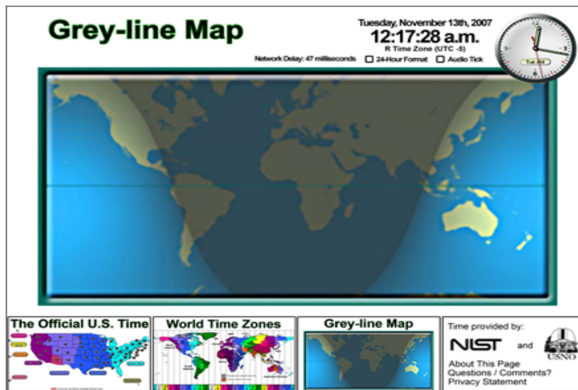
Figure 2. The gray-line map view.

Another option is the world time zone display. It shows a world map with color-coded time zones and the current time in each (Figure 3). This is another option that is highly requested by users of the current site, since many people know the hour differences between time zones in the continental United States, but they do not know the differences for time zones in other parts of the world. Daylight Saving Time (DST) rules and borders change fairly often throughout the world, so this page uses an Extensible Markup Language (XML) database of time zone rules to display the local times in several countries. This database is kept current in accordance with the World Time Database Subscription Service *, a paid service that prides itself in keeping as up-to-date time zone information as possible. The site has a