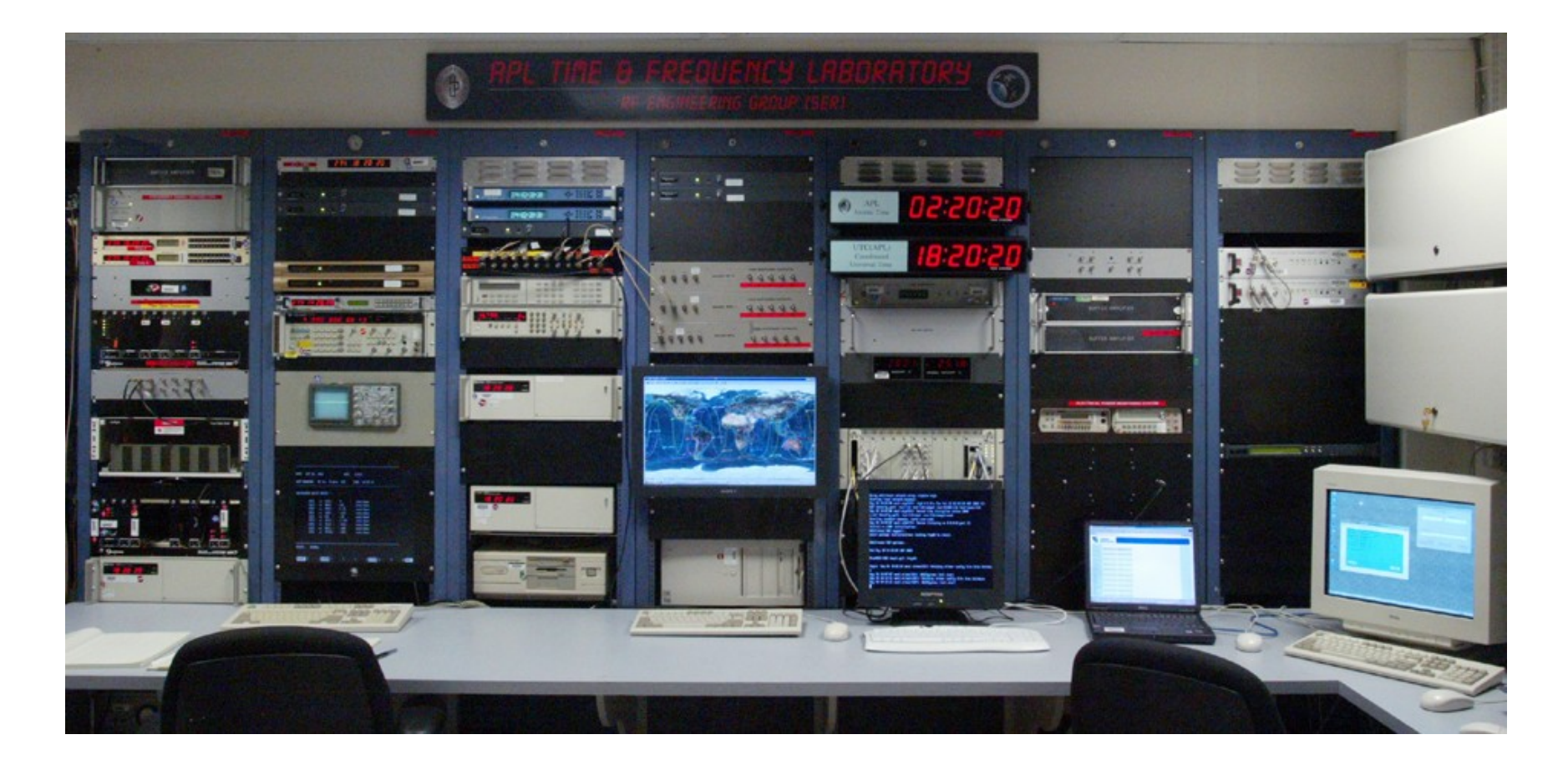
FIGURE 2: The APL Time and Frequency Laboratory

35<sup>th</sup> Annual Precise Time and Time Interval (PTTI) Meeting