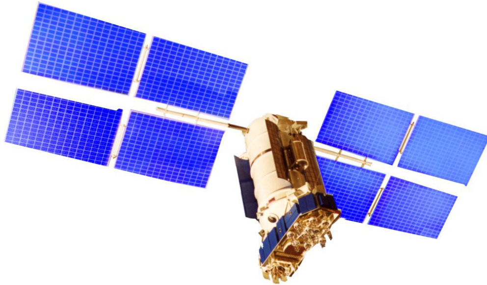
Figure 2. GLONASS-M satellite overall view.

The GLONASS-M satellite can be launched in tandem (three satellites simultaneously from the Baykonour Cosmodrome using a Proton-M launcher with a Breeze-M booster) and in a single launch (from the Plesetsk Cosmodrome using a Soyuz-2 launcher with a Fregat booster).