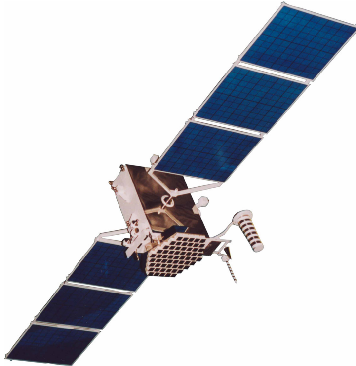
Figure 3. GLONASS-K satellite overall view.

The Time Synchronization Subsystem is intended for: