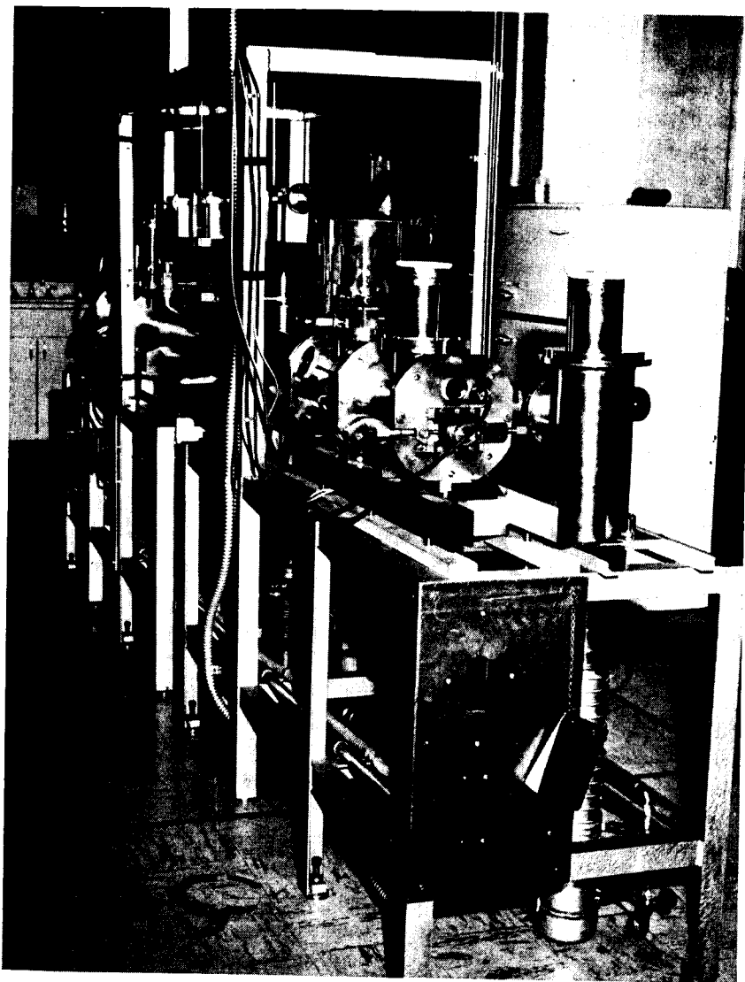
Fig. 1. Cesium atomic beam frequency standard (NBS II).

are observable. There is no observable trace of the \pi(\Delta m_F = \pm 1) transitions. If the intensity of the \pi transitions were exactly zero then the matrix elements connecting adjacent m_F levels are all zero. This means that a shift can be